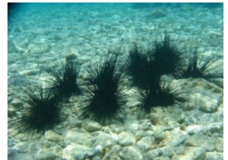
Sea Urchin