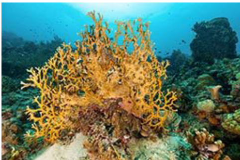
Fire Coral/ DAN

Moon Jellyfish and Portuguese Man-O-Wars: Jellyfish and man-o-wars pose a limited risk during Sea Base Adventures. Moon jellyfish stings can cause skin irritation and minor pain. Treatment includes rinsing the affected area with vinegar. Man-o-wars can cause skin irritation, swelling and pain. Treatment includes removing the tentacles and rinsing the affected area with vinegar. If swelling worsens or an allergic reaction occurs, medical evaluation and/or treatment may be required.